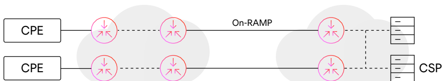
Option 3: Dual physical ports and dual cloud connections provide full redundancy from customer's network onward