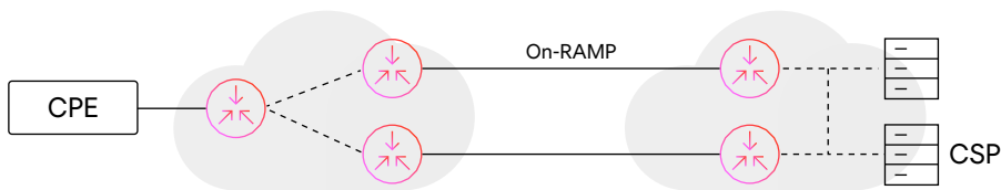
Option 2: A single physical port and dual cloud connections provide full redundancy from Arelion's backbone onward